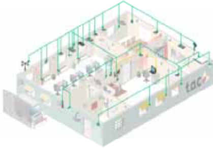
Best Practices - Fundamental

This is the starting point for the facility manager who wants to move beyond programmable thermostats or sensor-activated lighting controls. Techniques for fundamental control include: