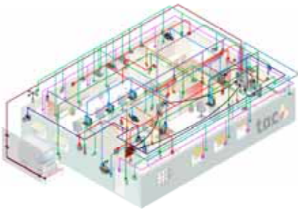
Best Practices - Integrated

The concept of integrated control is an extension of fundamental and advanced control, but with links to more diverse parts of the healthcare facility. Integrated control provides a high level of potential business benefits, plus the flexibility to expand control, at least cost, for future energy savings objectives.