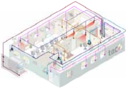
Best Practices – Advanced (cont.)

Optimum Stop – Determines the earliest possible time to initiate setback temperatures before unoccupied periods while still maintaining occupant comfort. Also known as “coasting.” Space temperature drifts gradually beyond comfort levels in anticipation of the unoccupied period.