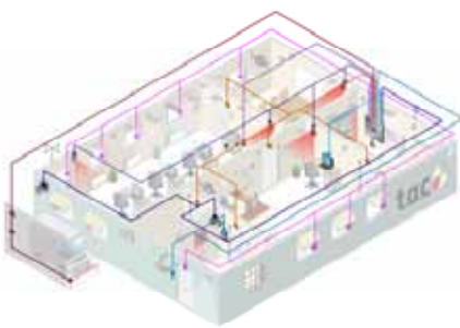
Best Practices - Advanced

In most cases, the same BAS put in place for fundamental controls is also capable of more advanced control applications, often with only software changes. Techniques for advanced control include: